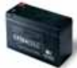
B12-B 12V 6Ah batteries Pc/pack 1