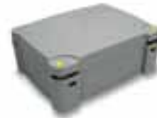
BA3-A Nice box for batteries