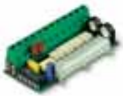
PIU expansion card for control unit Pc/pack 1