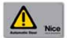
TS signboard Pc/pack 1

Nice recommends customers order products in pallets in order to facilitate storage and delivery, and ensure packs are uniform. The number of packs per single pallet has been specified for this reason.