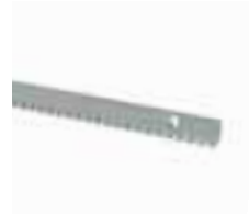
ROA8 M4 rack, 30x8x1000mm, zinc coated with spacers and screws Pc/pack 10