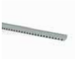
ROA7 M4 rack, zinc coated, 22x22x1000mm Pc/pack 10