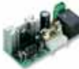
CARICA plug-in card for battery charger Pc/pack 1