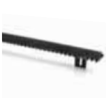
ROA6 M4 25x20x1000mm slotted nylon rack with metal insert Pc/pack 10