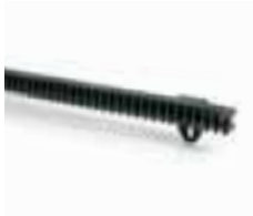
L05 plastic rack 26x26x500mm, for gates weighing up to 400Kg Pc/pack 10