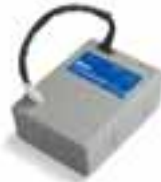
PS124 24V battery with built-in battery charger Pc/pack 1