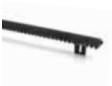
ROA6 M4 25x20x1000mm slotted nylon rack with metal insert Pc/pack 10