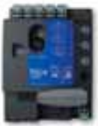
RBA2 spare control unit for RBKCE